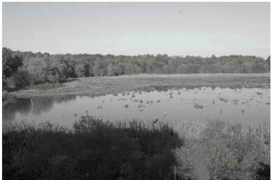
View from the Tower - October 2005

During the summer drought, the beavers were still active in the vicinity of the boardwalk loop. However, mobility their became severely hampered with the near absence of water. They were regularly seen just "hanging out" in the saturated